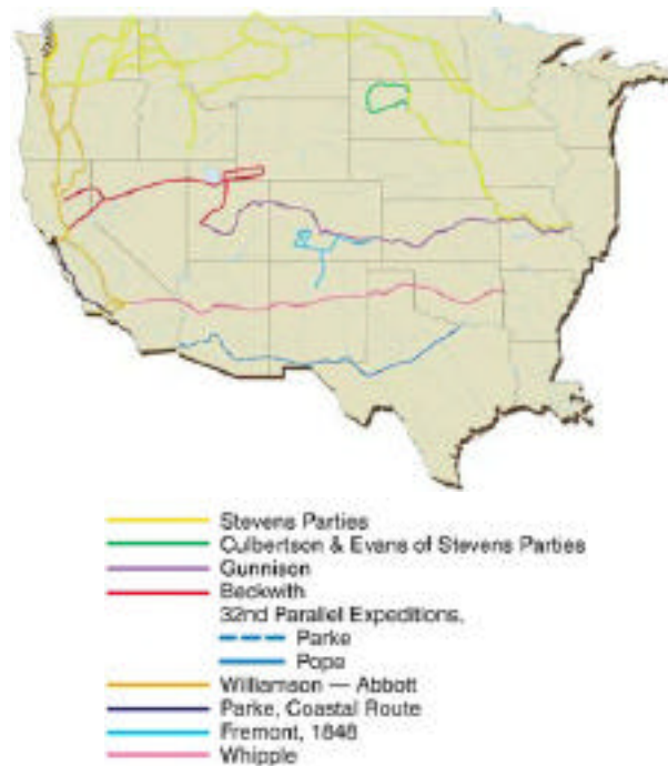
Survey Route Map - Pacific Railroad Surveys

Senate, House of Representatives, U.S. **Reports of Explorations and Surveys to Ascertain the Most Practicable and Economical Route for a Railroad from the Mississippi River to the Pacific Ocean. 1853-4. Washington, D.C., U.S. War Department. Volumes I - XII in 13 books with map volume. ("Pacific Railroad Surveys") See books available online.